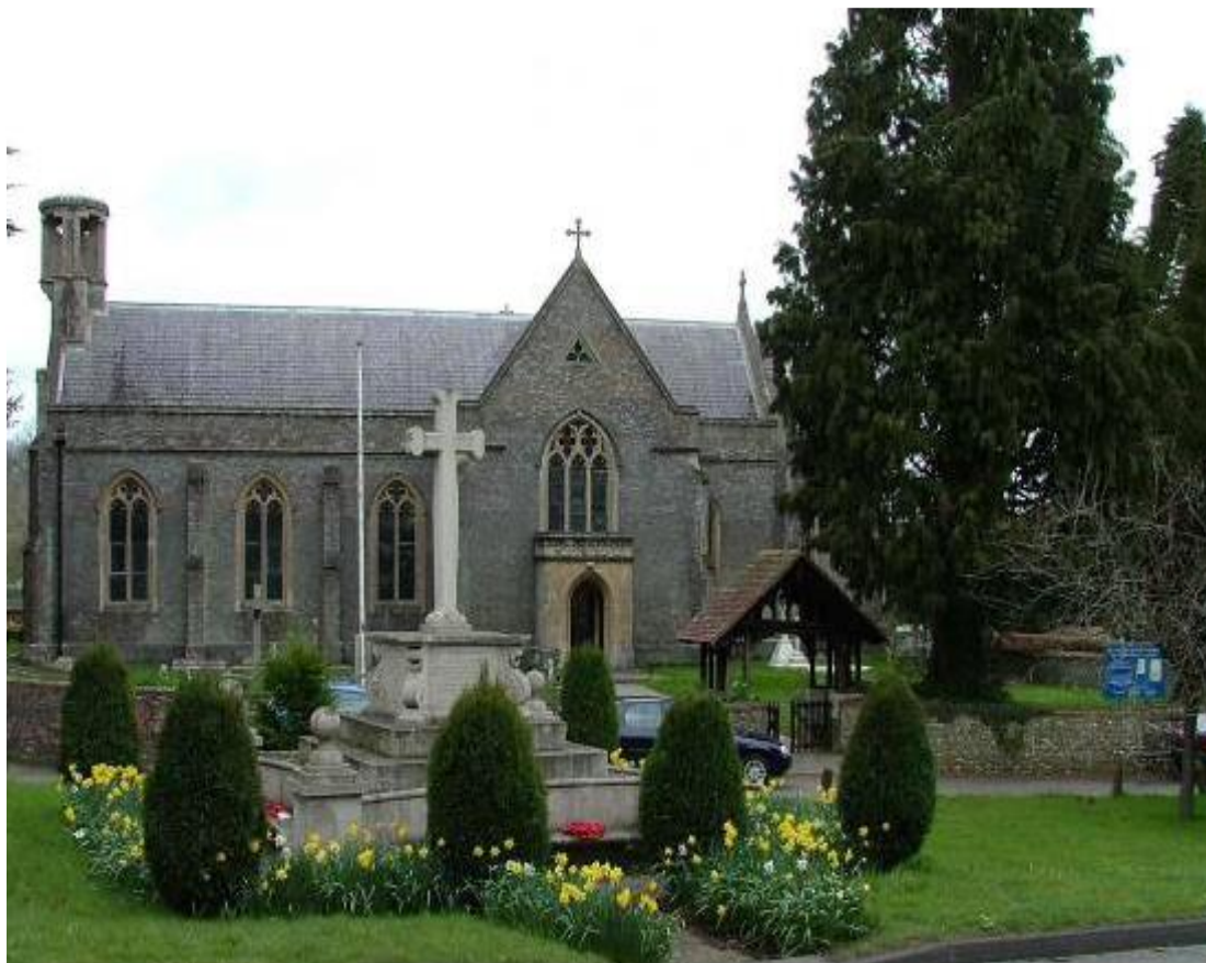
St. Matthew's Church, Otterbourne